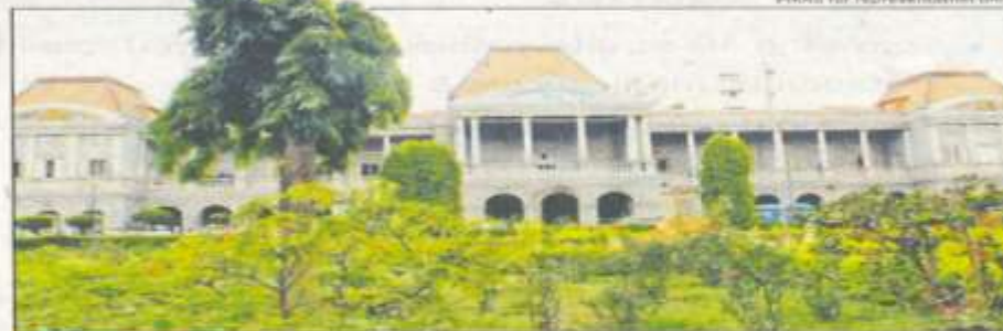
REPOSING FAITH: Among the objectives of the proposed scheme is to bring more patients to government institutions such as Victoria Hospital (above)