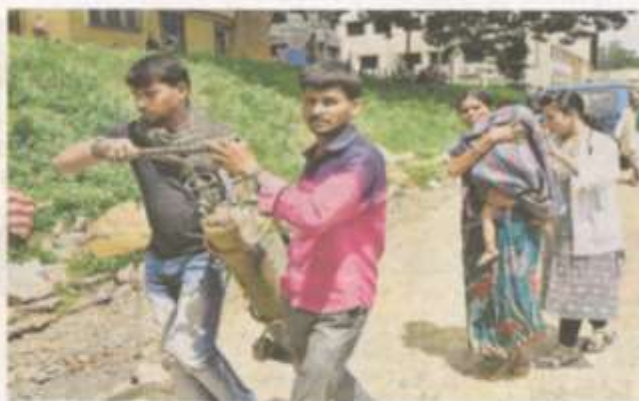
Sorry state: Recently, a woman was forced to carry her child to the pathology laboratory, while her relatives carried an oxygen cylinder for her, at the Karnataka Institute of Medical Sciences in Hubballi.

This was not a lone case of inefficiency on the part of medical college hospitals. In June, an old woman had to drag her husband on the floor from the scanning