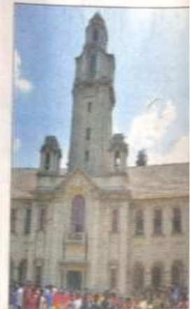
Indian Institute of Science, Bengaluru, is in the process of formulating its proposal for seeking Institute of Eminence status and hoping to obtain "maximum" financial assistance from the UGC.