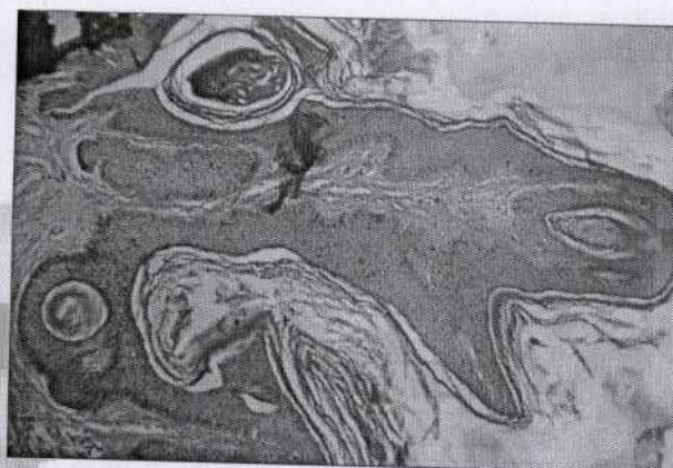
Figure 2: Histological section shows marked hyperkeratosis, papillomatosis, acanthosis, and horn cysts. (H and E, ×100)