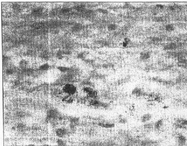
Figure 3: In the nerve showing enormous granular forms of arranged in globi in mid-borderline lepromatous neu (Modified Fite-Faraco, x 1000)