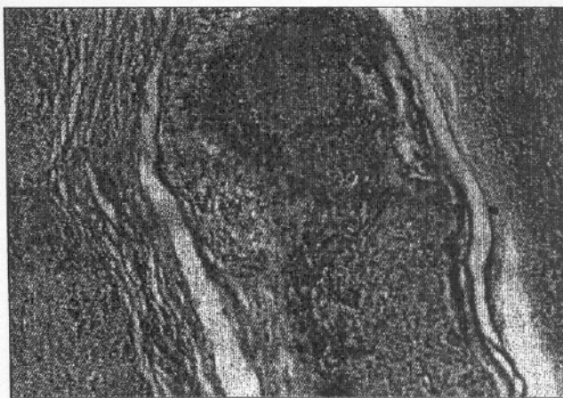
Figure 1: Longitudinal section of nerve showing mid border neuritis with mixture of foamy macrophages, lymphocytes and occasional epithelioid cells (H & I 100)

After obtaining informed consent and after pre-surgical preparation, partial or full thickness biopsies of the sural, radial cutaneous or great auricular nerves were taken from near the skin lesions. The sural nerve was biopsied approximately 5-7 cm proximal to the lateral malleolus, between the Achilles tendon and the lateral border of fibula, through a superficial, vertical and elliptical incision. The radial cutaneous nerve was biopsied at about 3-5 cm proximal to the radial styloid process, over the lateral border of the radius, with a vertical or transverse superficial incision, keeping in mind the position of the radial artery at the wrist. For the great auricular nerve, an oblique incision was made over the areas of the nerve crossing the