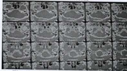
Fig- 1b:- HRCT of the Temporal bone showing normal mastoids.