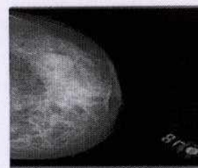
Figure 2: Mammography of left breast.