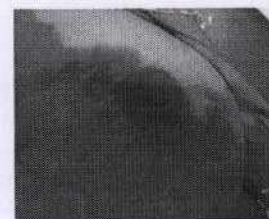
Figure 1: Sinus and ulcer over breast.

Radiological imaging modalities like mammography or ultrasonography are unreliable in distinguishing it from carcinoma [7,8] because of the variable pattern of presentation of such an inflammatory lesion. The number of cases of PNHL (Primary Non Hodgkin's Lymphoma) of the breast reported to date is around 250.