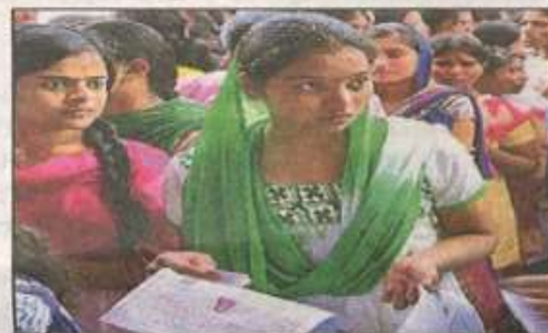
There were translation errors in the Tamil NEET question paper, according to Madras HC