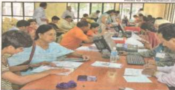
FUTURE TENSE: Karnataka Examinations Authority plans to complete the first round of counselling by Saturday