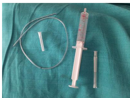
Figure 1: Drain tube, syringe, needle cover.

The readily available resources in the operation theatre like, tube drain, disposable syringe and needle cap were used for the suction drainage. After the surgical procedures like thyroidectomy, submandibular salivary gland surgery, subcutaneous benign lesion excision, a tube drain with terminal holes was kept in wound cavity and closure of the wound was done. A plastic syringe is then connected to the tip of the tube drain (5 cc, 10 cc, 20 cc). The size of the syringe can be chosen depending on the depth of the cavity. Then suction is created by pulling the piston and it is stayed by using needle cap in the groove of the piston (Figures 1 and 3). The suction in the syringe can be maintained by repeating the release of piston and reapplication of piston. It will exactly notify about the amount and type of fluid in the drain. The drain can be removed once the amount of fluid lowers down. In our case we used it in thyroid surgery, patient underwent hemithyroidectomy and we kept a tube drain in situ connected to syringe suction drain (10 cc syringe) (Figure 2).