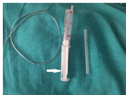
Figure 3: Syringe with Piston and needle cap institution.