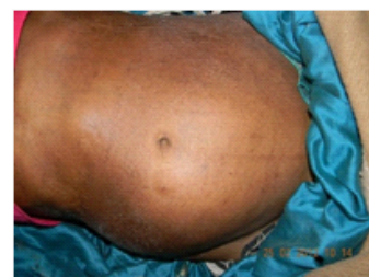
Figure 2: Mass occupying entire abdomen.