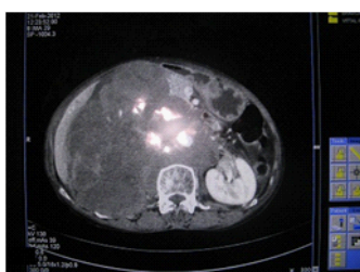
Figure 4: Renal mass Right side.