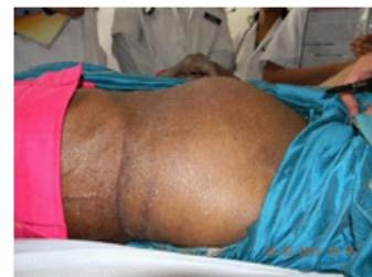
Figure 1: Mass abutting ant abdomen.

Liver multiple hypodense areas were seen, largest measuring 3.2 × 2.6 × 3.5 cm. Bilateral pleural effusion seen (Figures 3,4 and 5). FNAC (Fine needle aspiration cytology) shows round to polygonal cells having coarse chromatin. 2-4 nucleoli arranged in discreates. The nuclear