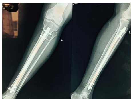
1 Year Follow Up