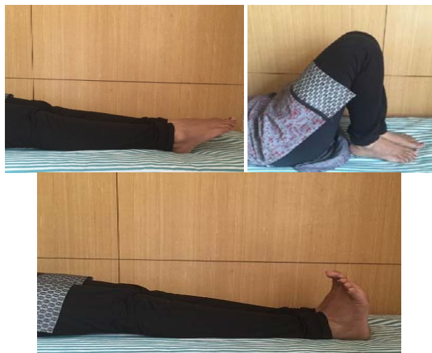
Full Range Of Knee and Ankle Movements at End of 6 Months