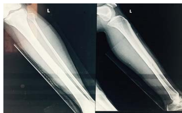
Pre-Operative X Ray