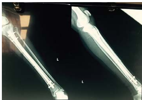
Immediate Post-Operative X Ray