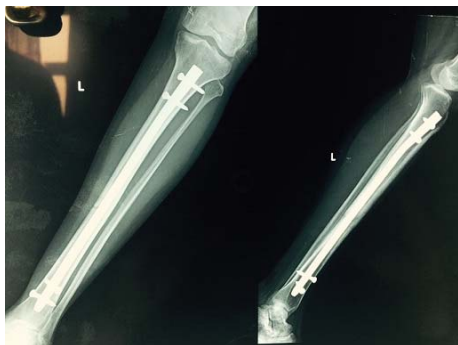
6 Months Follow Up