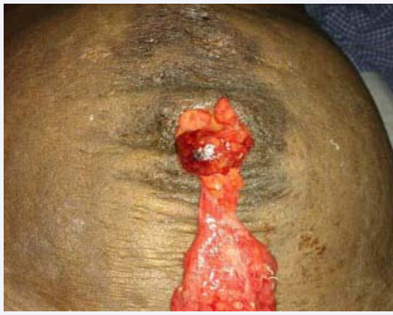
Figure 1 Intra Op showing the exteriorisation of omentum following skin necrosis.