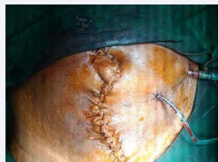
Figure 4 Skin closure and drain placement.

Spontaneous rupture of abdominal hernia is very rare and usually occurs in incisional and recurrent groin hernia [11] only few cases of spontaneous rupture of abdominal hernia are reported in the literature. Large IH is contained only by its sac and thin avascular skin. Larger the hernia, more atrophic and avascular is the overlying skin and this along with thin sac leads to higher chances of rupture of IH [12]. Neglect for early operative intervention or delay in seeking for treatment increases the risk of rupture [13,14]. The rupture may be sudden following any event, which can increase intra-abdominal pressure such as coughing, lifting heavy weight, straining at defecation and micturition or it may be gradual after developing an ulcer at its base [12]. In our case, rupture of an IH occurred due to the sudden rise in intra-abdominal pressure following a cough and also with predisposing ulcer skin ulcer formation a day prior to it. The hernia contents can be covered primarily by mesh repair