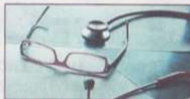
VACANT SEATS IN COLLEGES

"The Board of Governors reviewed the proposal in terms of the vacant seats and the number of additional eligible candidates to be provided for filling the