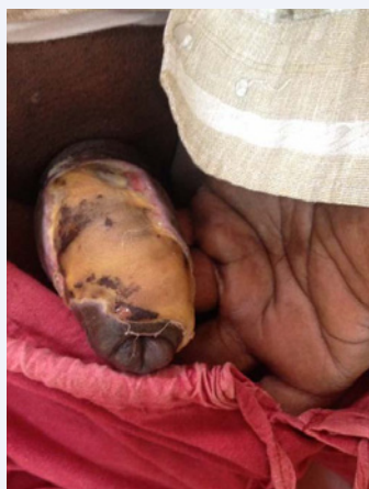
Figure 2 Discolouration of the penis with vesicles filled with hemorrhagic fluid.

Fournier's gangrene is described as a rare, fulminant, and usually localized disease of the scrotum and penis, with occasional extension up to the abdominal wall. The usual organism is an anaerobic streptococcus synergistic with other organism like enterobacteria species, staphylococcal species, anerobic organisms and fungi [4]. Rarity in our case is involvement of the gangrene to the penile skin alone, with no extension to scrotum or abdominal wall is the characteristic feature in our case. Early therapy is the key, including hospitalization, debridement of the entire shaft of the penis distal to the devastated area without excising the normal skin, parenteral broad-spectrum antibiotics and skin grafting. Only few cases of Fournier's gangrene of the penis have been reported.