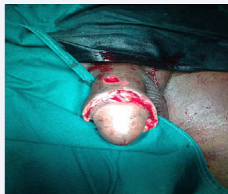
Figure 3 Penile skin Post-Debridement.

Infection represents an imbalance in host immunity, which is frequently compromised by one or more of the above-mentioned co-morbid systemic processes and the virulence of the causative microorganisms. In our case the diabetic being the predisposing factor leading to immuno-compromisation leading to the disease. The aetiological factors allow the portal for entry of the microorganism into the perineum. The compromised immunity provides a favorable environment to initiate the infection and the virulence of the microorganism promotes the rapid spread of the disease [4].