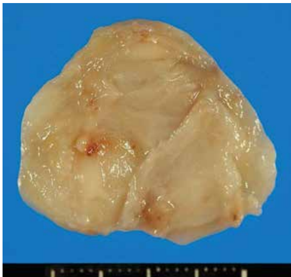
Fig G – Excised Specimen

Histo-pathological report showed features of Nodular Fasciitis. Post-operative period was uneventful.