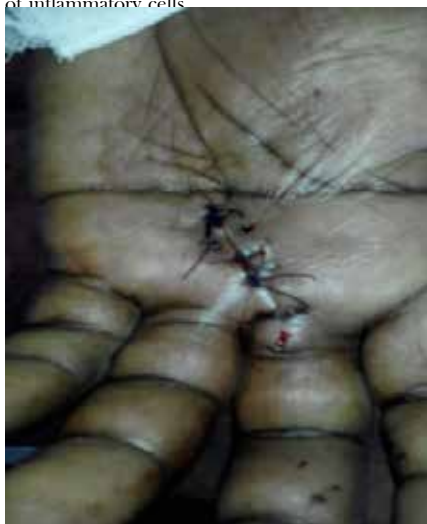
Fig J – Sutured Wound on post-operative day 3.

The patient was followed up for a period of 6 months. There were no signs of recurrence.