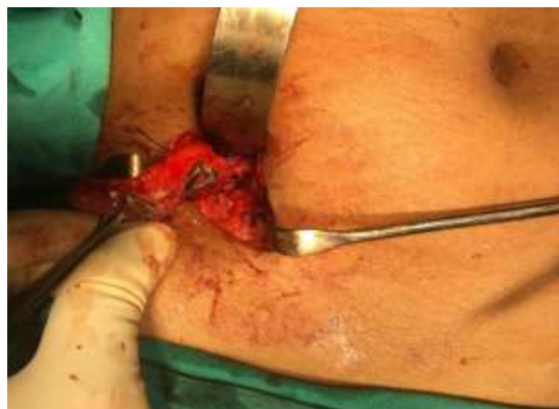
Figure 3: Interval appendectomy.