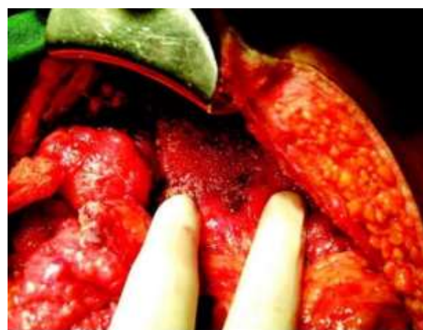
Figure 4: Plastered abdomen with multiple tubercles.