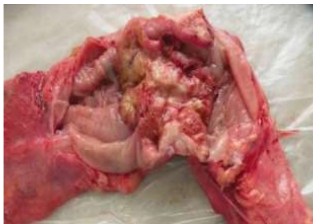
Figure 1: Carcinoma caecum.